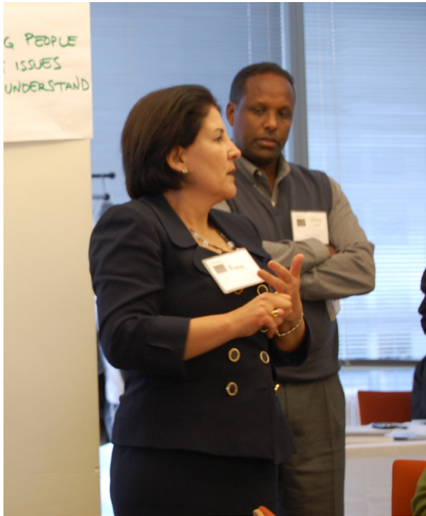
Representatives of Afghan Coalition and African Advocacy Network engage in discussion at a CEF convening.

In the years since then, a set of policies, laws, legal decisions and surveillance practices have emerged that continue to have chilling effects on giving to nonprofits serving AMEMSA communities. In addition, foundation leaders' views about the Palestine-Israel conflict have played a role in lack of funding to AMEMSA communities in the U.S. And even today, AMEMSA community organizations are often deemed too risky for funders to support due to a general lack of familiarity about them and the communities they serve.