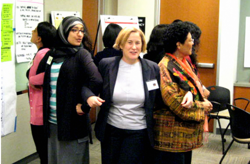
Group exercise at a CEF convening with representatives from CEF funders and the funder community.

when they get in the way of the collaborative or trusting environment. An important learning is that while funder collaboratives create efficiencies for funders, they also need to be sufficiently resourced by the participating funders. The type of deep engagement with communities and grantees that makes the funder collaborative such a rich learning environment requires a great deal of staff time and organizational resources. In addition to grantmaking, the host organization's responsibilities include gathering and tracking data, bringing funders together on a regular basis, working with community partners, developing learning opportunities for the field, and developing and disseminate research, data and stories. Adequate support for all these roles is necessary to engage in effective field building.