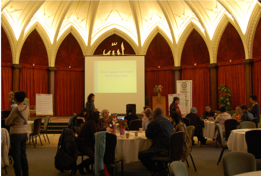
Civic Engagement Fund final convening. Islamic Cultural and Community Center, Oakland, CA.