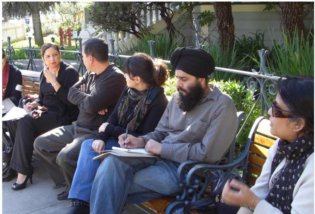
Participants at the first convening of Phase 2 discuss the political participation of their communities.