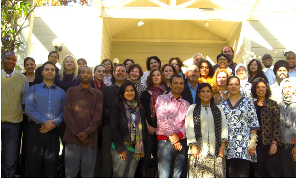
CEF cohort at first convening of Phase 2.