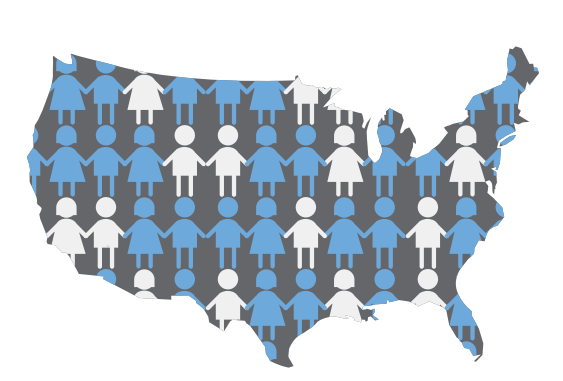
In 2050 the nation's population of children is expected to be 62 percent children of color.<sup>3</sup>