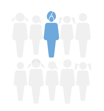
By 2060, one in ten Americans will be AANHPI.

With a 46 percent growth rate between 2000 and 2010, Asian Americans are the fastest growing racial group in the country. There are currently about 19 million Asian Americans and 1.2 million Native Hawaiians and Pacific Islanders, who make up 6% of the U.S. population.<sup>1</sup> By 2060, these numbers are projected to grow to 40 million, and one in ten Americans will be Asian American, Native Hawaiian or Pacific Islander (AANHPI).<sup>2</sup>